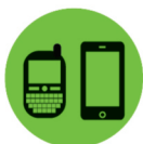
PROTECTION LTE MAXIMALE