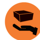
COMPACT SINGLE UNIT PACKING